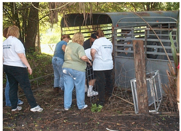
Lee County Animal Services working along side rescue volunteers to load and transport six pigs abandoned in N. Fort Myers, Florida in 2001